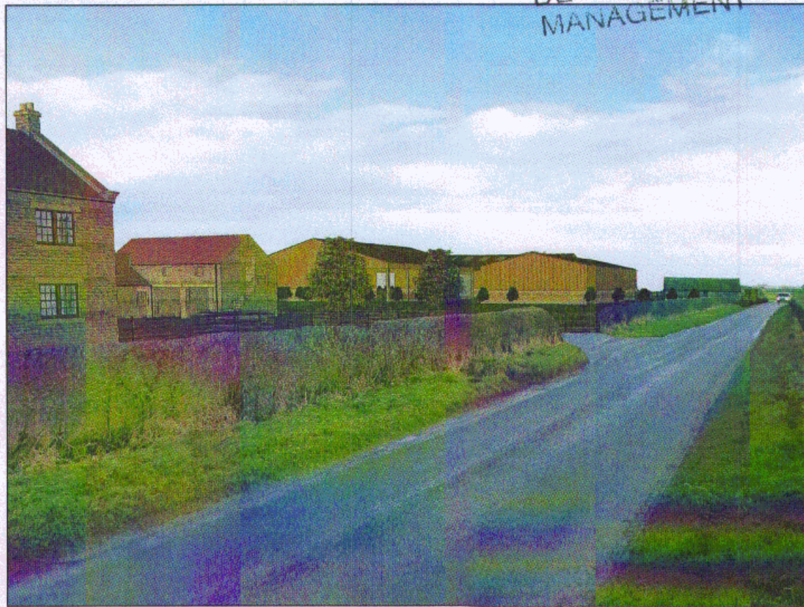
Superimposed 3D Model on photograph from Cawton Road - North East